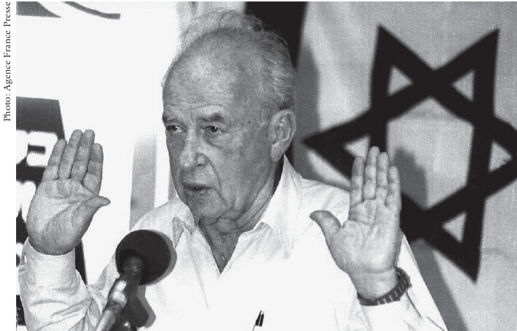
Israeli prime-minister Yitzhak Rabin (1922-1995).