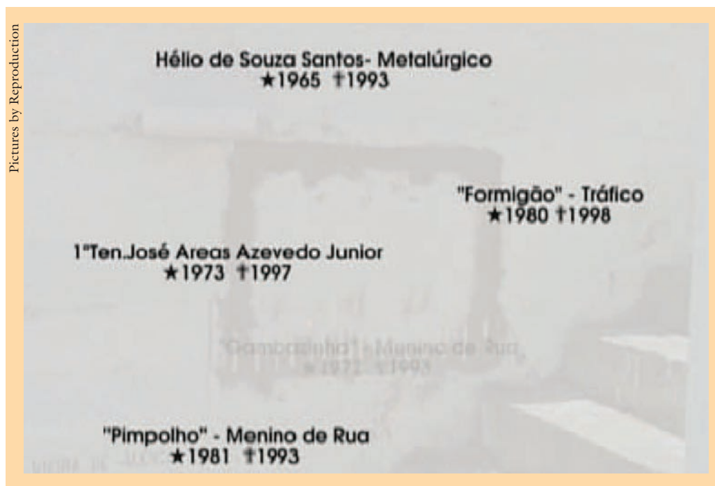
Figure 1 – The corpses of the drug trafficking war.

makes us support those people who are in the middle of the crossfire of that drugs war.