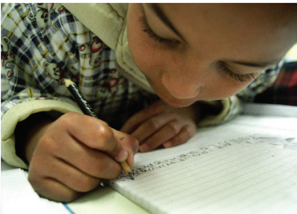
A student uses a pencil to write down dictated words in a public school class in São Paulo.