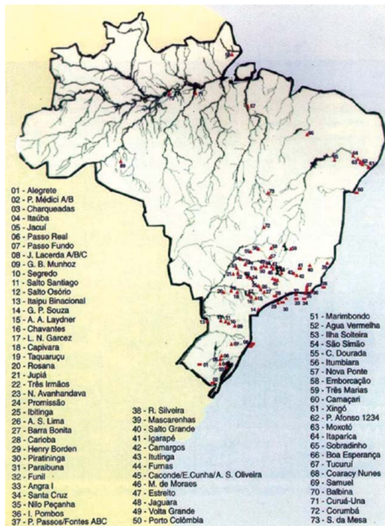
Figure 1 – Distribution of the main hydroelectric power plants in Brazil. Notice the concentration in the South and Southeast regions (Kelman et al., 2006).

The main decurrent problems after the construction of the reservoirs have to do with the need for an integrated management of the multiple uses and with the integration between the system's operation, the limnologic and hydrologic functioning, the control of the impacts originating from the hydrographic basin, which are produced by the very expansion of the regional economy and its diversification due to the existence of the reservoir (Straskraba et al., 1993; Tundisi, 1994).