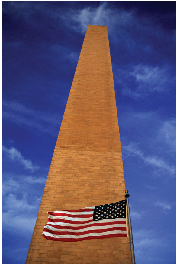
The Washington Monument.

My fellow citizens also need a better grasp of what the phrase "my country right or wrong" means in a democracy. In a democracy you vote your approval when your country is right, but when it is wrong it is not only your right, but also your duty, to voice your disapproval. Fear must not promote silence. That is why dissent is patriotic and why it is most patriotic to fight for the constitutional rights of even those you disagree with. That is why as a secular Jewish left-wing citizen of the U.S. I support the efforts of human rights organizations, such as the New York City based Center for Constitutional Rights, to protect the civil liberties of Moslems in my country. Broadening U.S. citizens understanding of what constitute human rights at home and worldwide is the best way for people in my country to learn the lessons of the McCarthy period.