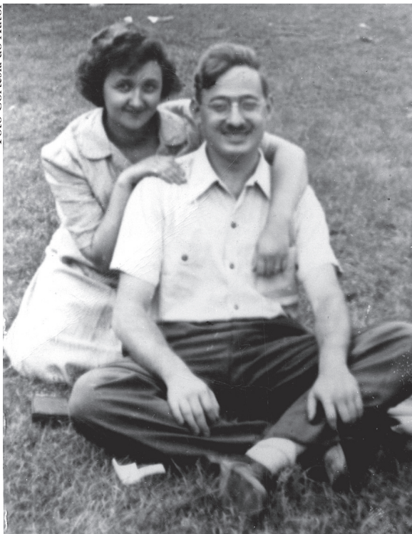
Ethel and Julius Rosenberg - 1942.

Judge Kaufman's sentencing speech made the political context of their case clear. He justified a death sentence for the crime of conspiracy in part by saying: