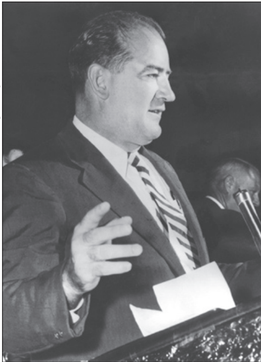
American Senator Joseph McCarthy (picture) conducted a violent pursuit to supposed communists, which became known as “witch-hunt” and, later, McCarthyism.

Neither committed the crime they were executed for. And the United States government knew all along that Ethel Rosenberg was not an espionage agent.