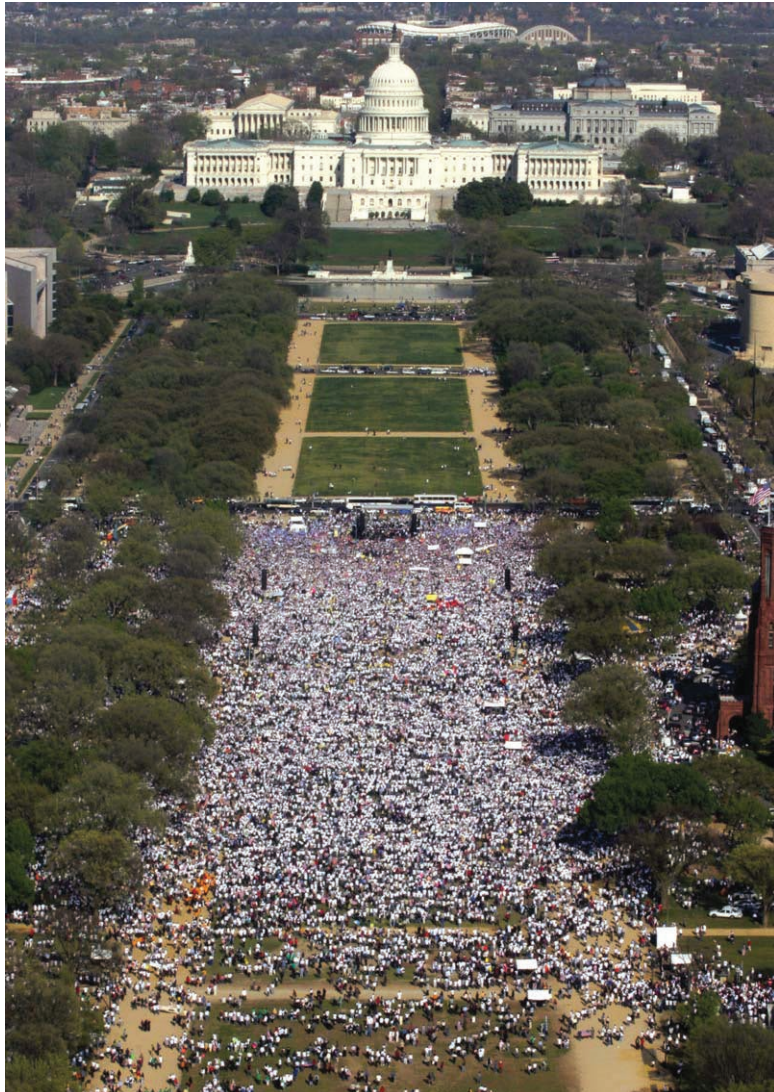
Protest in front of the White House, in Washington, against the immigration policy of the United States.

the major dimensions of the regulation theory about the emerging processes of internal and international migrations in different regions of the world. The author resumes the idea that used to be very dear to the hearts of the population scholars on the issue of the temporal and spatial reproduction of work in the capitalist society; each accumulation regimen corresponds, approximately, to a demographic regimen associated to it. Taking into consideration the transition from the fordism to the flexible accumulation and its most significant dimensions, the author concludes that the patterns of contemporaneous migration reflect two dimensions of the current capitalist regimen: its instability and the new structure of economic opportunities that emerges with the flexible accumulation. In this context, migration is