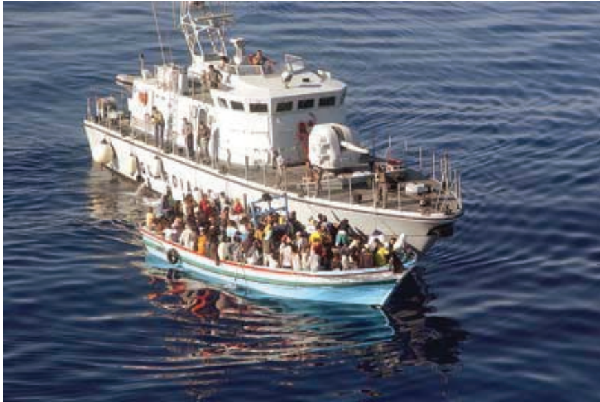
A boat carrying 177 illegal immigrants is intercepted by the Italian Coast Guard.

increasing volume of migrants; the transfers are performed with the help of profiteering middlemen “on duty” that transform them in lucrative bargains; reactions of xenophobia, intolerance, discrimination, and conflict are aggravated. Moreover, the actors that do not speak in the reports are speaking more and more in public manifestations and reclamations of social movements. It seems to be unavoidable, in dealing with the proposals of management of the international migrations, to take into account the voice of the involved actors – and such voice, in a clear and irreversible way, makes itself present in the increasing and powerful social movements.