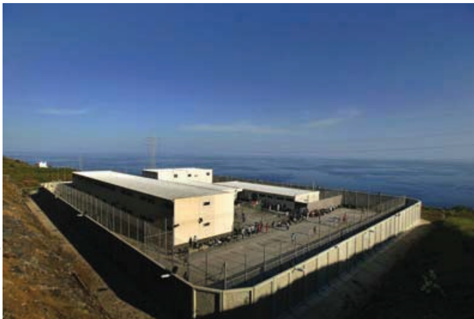
Illegal immigrants in the Detention Center of Hoya Fria, in Santa Cruz de Tenerife, Spain.

international migratory movements, clear and inevitable expressions of conflicts and still more acute contradictions in the present stage of the capitalist development; we should take into consideration, therefore, the implications of those discourses for the design of emergent policies on the contemporaneous international movements, in their multiple modalities and dimensions.